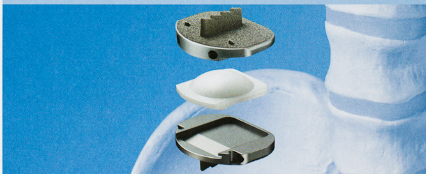
Prodisc-L for Lumbar Total Disc Replacement