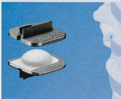
Prodisc ® -C