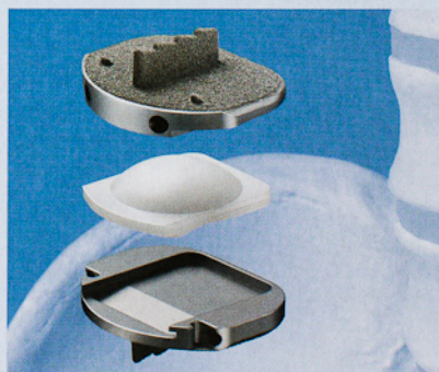
Prodisc ® -L